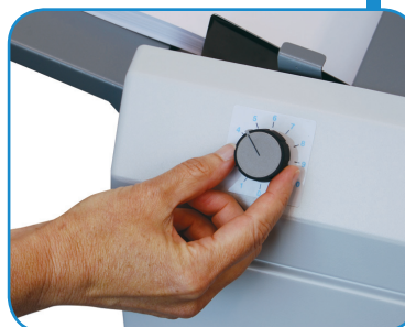
Variable speed control knob

Skew Adjustment: Adjusts feed table left or right for crisp, accurate folds