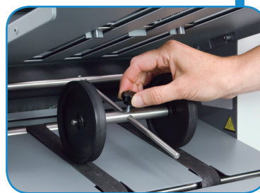
Adjustable stacker wheels help to keep folded documents in a neat stack

Formax - New Hampshire, USA www.formax.com